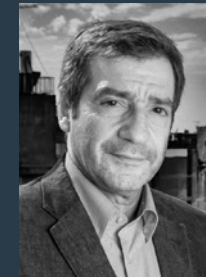
Yorgos Kaminis Mayor of the city of Athens

As mayor of the city of Athens, I would like to pledge my full support as well as the support of the city of Athens Convention & Visitors Bureau, to Greek Society of Clinical Chemistry & Clinical Biochemistry in its effort to host the 2017 Meeting of EuroMedLab.